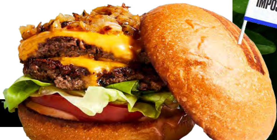
#MV620 - 10 lb. 4 oz. Meatless Burger Patty