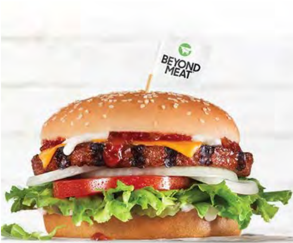
#N1956 - 10 lb. 4 oz. Vegetable Burger Patty